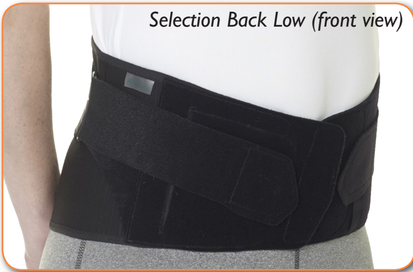
Selection Back Low (front view)