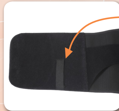
"Closing straps" to assist donning and doffing.

A lot of attention has been given to the front closure to avoid bulky material and instead make a soft and smooth closure that feels comfortable and yet provides good abdominal support.