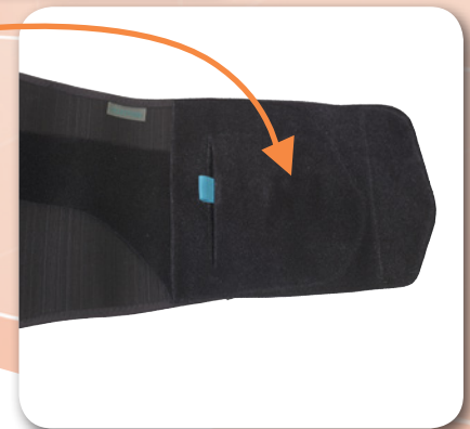
Pocket to make it easier to don and doff.